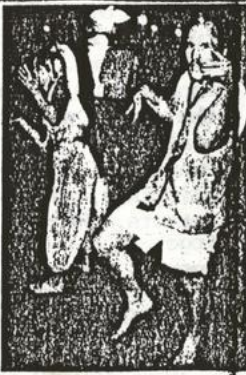
Dancers were everywhere