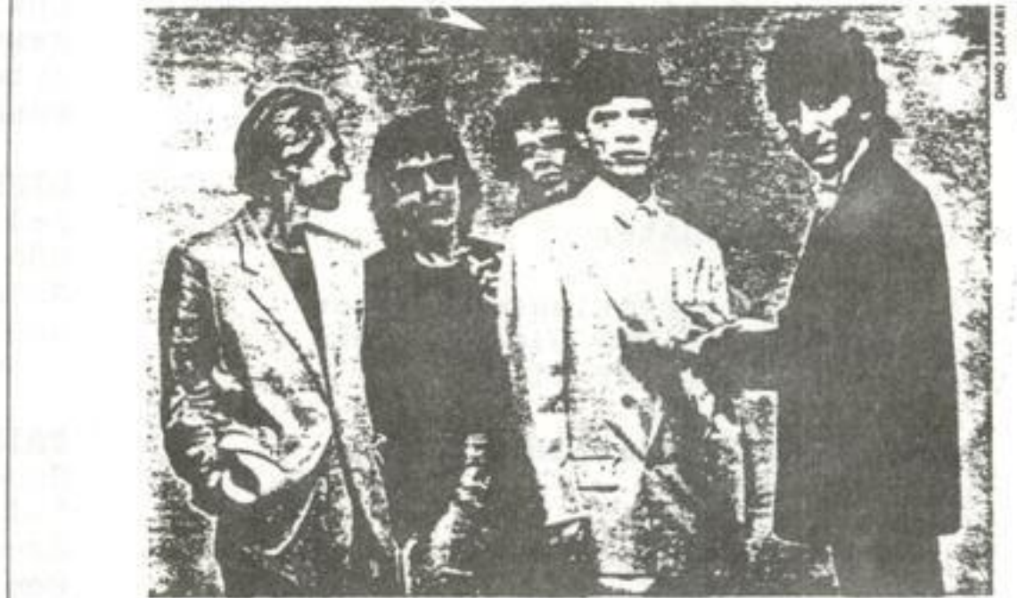
Gimme shelter: The Rolling Stones, from left, are Charlie Watts, Bill Wyman, Keith Richards, Mick Jagger and Ron Wood.

Q After the recent disasters — Hurricane Hugo and the California earthquake — I saw Ronald Reagan doing a commercial for the American Red Cross relief effort. Did he get paid for doing that spot, and has he donated to the effort? What have other celebrities been doing to help?