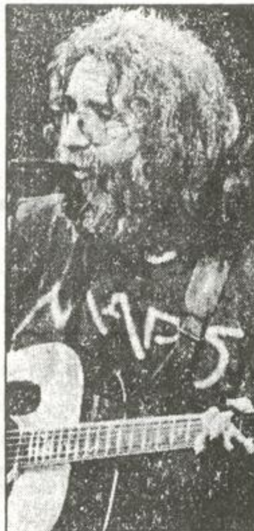
Garcia: up there

■ The New York Post says that Bob Weir was in New York dining with Marvel Comics executives the other night, kicking around the idea of a Grateful Dead comic book.